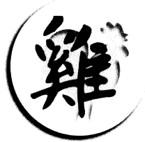
Year of the Rooster 4703