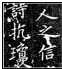
Kaishu regular script